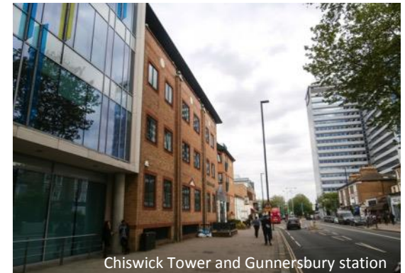
Chiswick Tower and Gunnersbury station

Recently refurbished offices 1,614 – 3,540 – 5,154 sq ft